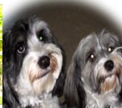
Zeke and Nutmeg